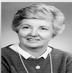
- Joan Robinson

The purpose of studying economics is not to acquire a set of ready-made answers to economic questions, but to learn how to avoid being deceived by economists.